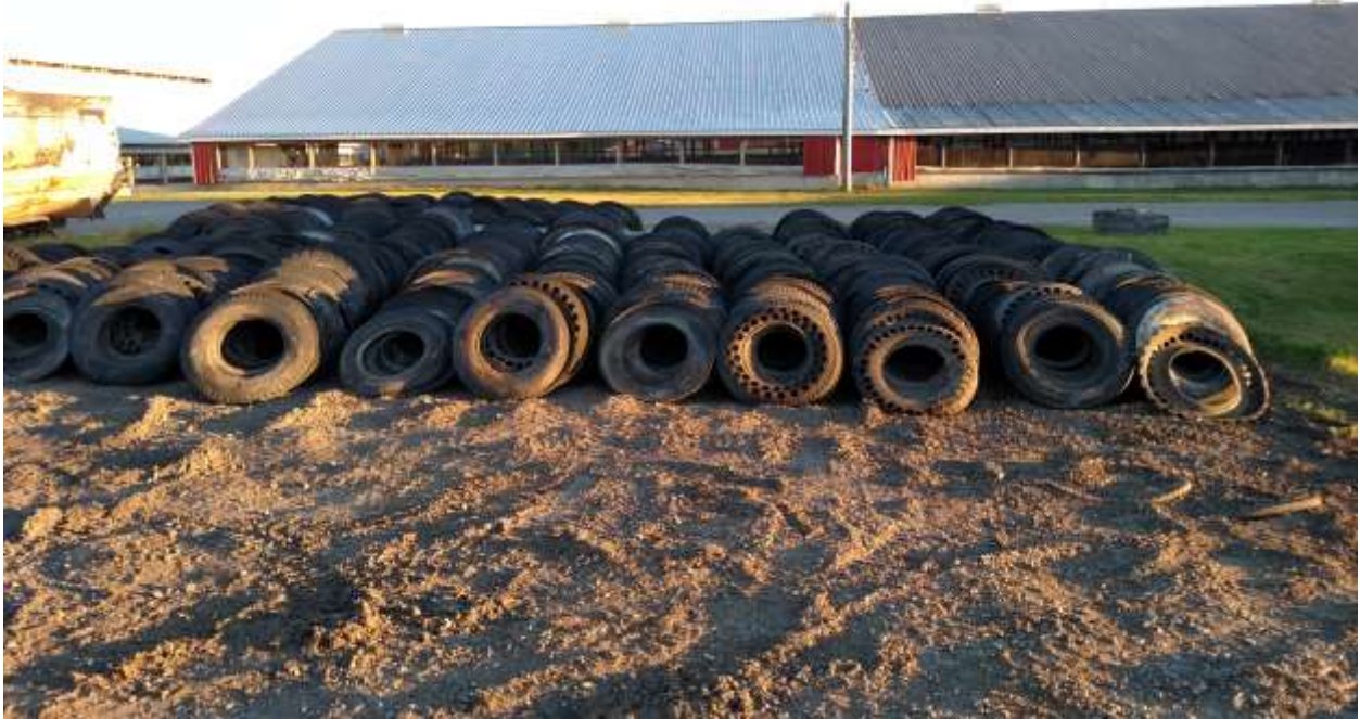
Image 2: Side walls that have been halved and holes drilled in them. The farmer paid approximately $2.00 per side wall.