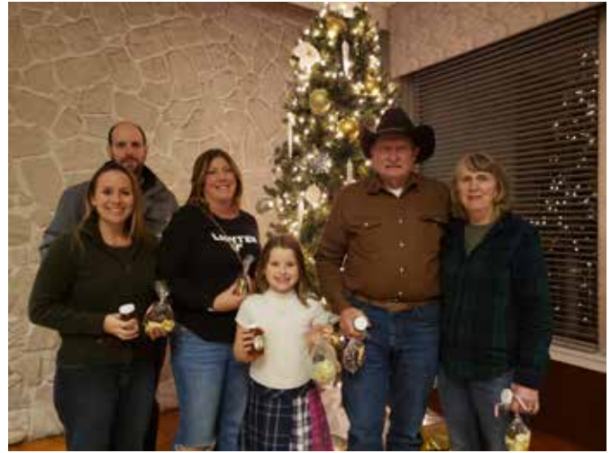
Photo bottom right: Attendees had the opportunity to win a variety of raffle prizes donated by both local Oneida County area businesses and members of the Oneida County Farm Bureau.