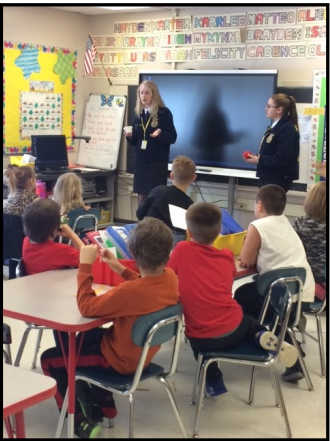
FFA students spent time with South Lewis 2nd graders during Agricultural Literacy Week.