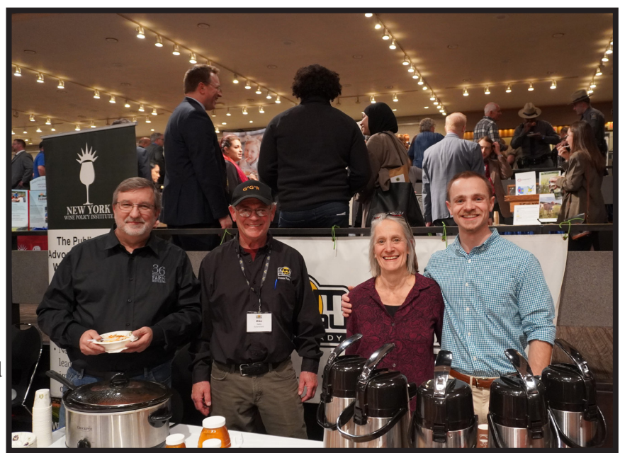
Members of the County Board at the 2024 NYFB Taste of NY Reception

As you know, an organization like ours has to grow or it will wither on the vine. We are asking you, our members, to reach out to friends, neighbors, and co-workers about the benefits of Farm Bureau membership. The benefits are many, from networking and discounts at many agricultural equipment and service suppliers, to joining our voices and influencing how our local, State and Federal governments work to support and grow agriculture.