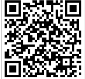
Application Deadline February 18, 2025