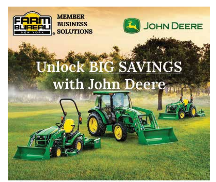
*Must be a New York Farm Bureau member for 30 consecutive days prior to purchase. Proof of membership is required. A valid member email address is required for eligibility. Discounts are subject to change without notice. Check out the asyings on the following equipment categories; commerkal moving, residential mowing, utility vehicles, tractors, and compact construction. <u>https://www.deere.com/en/rewards/equipment-discounts/</u>