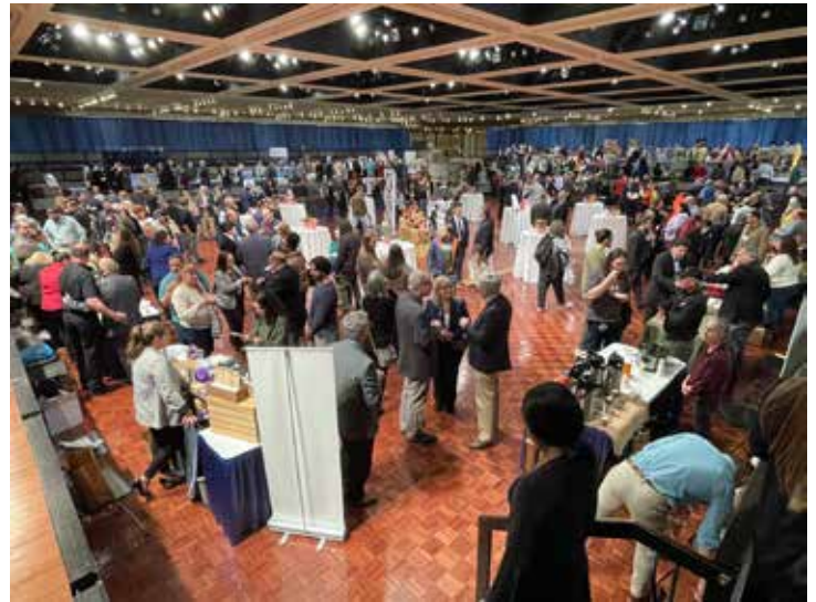
Photo: The very well attended 2024 NYFB Taste of New York held last March in Albany.

YCFB is seeking innovative ideas, volunteers, and sponsors for the 2025 event. We would love to hear what kind of foods, snacks, or beverages should share this year. Not only do we offer local foods, but we also share education and awareness of the rich and diverse agriculture of our region. From wine to whoopie pies... Yates County has a great story to tell! Will you be willing to tell the Yates County story this year?