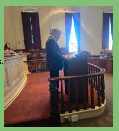
Photo: Wayne County Board of Supervisors proclaim March as National Ag Month during the March 18 Board of Supervisors Meeting.

On March 18, the County Board of Supervisors proclaimed March as National Ag Month in Wayne County. It is a time to celebrate and recognize the vital role of the agricultural industry, from food production to job creation, and to appreciate the contributions of farmers and ranchers. The signed proclamation encourages all residents to recognize and appreciate the significant contributions of agriculture to the community, state and nation.