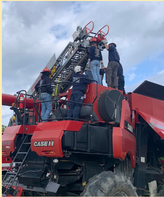
Photo: Simulated rescue of a “victim” from the top of a Westfield Ag & Turf combine.