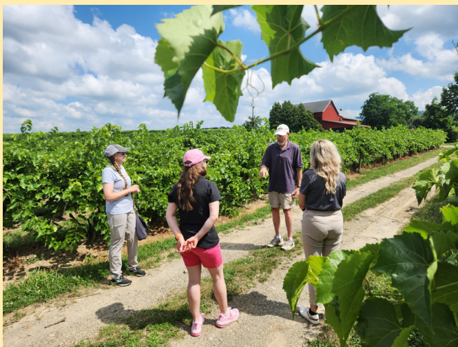
Photo: NYFB PPD staff touring Johnson Estate Winery.