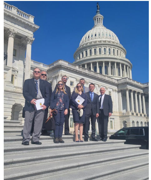
Photo: NYFB Washington DC trip participants April 2025.

At the end of April I accompanied the group from NYFB to Washington, D.C. While there, we visited with most of the members of Congress and staff that represent New York farms. We advocated for New York farmers, talked about labor, tariffs and tax policy and many of the current issues facing many of our producers in Chautauqua county. One of the highlights was an appointment we had with EPA administrator Lee Zeldin, where we discussed with him and his staff some of the pesticides that have come under scrutiny during the last administration. We particularly focused on Mancozeb and how important it is to the farms in Chautauqua County—how the producers use these products responsibly, and the hardship that would be caused by removing them from use. As always I did my best to express the virtues of Chautauqua County to all the folks we talked to and invited them to visit us. I really got a workout there as we must have walked ten miles throughout the city over the course of two days.