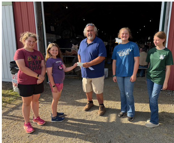
Photo far right: Horse barn 4-H'ers accept second place prize for the county fair barn contest.

Photo right: Dairy barn 4-H'ers accept first place prize for the county fair barn contest.